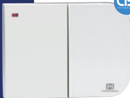
ASR-RF Receiver located near boiler.

OPERATING FREQUENCY 868Mhz AS2-RF - Battery ASR-RF - Mains CONTACT RATING ASR-RF 3(1) Amps 230-240V AC CONTACT TYPE Micro dis-connection Voltage free SUPPLY 230-240V AC 50Hz OPERATING TEMPERATURE RANGE 0°C to 40°C BATTERY TYPE Lithium + 3AA (AS2-RF) DOUBLE INSULATED Yes DIRT PROTECTION Normal situations ENCLOSURE PROTECTION IP30 TEMPERATURE CONTROL RANGE 5°C to 30°C STANDBY TEMPERATURE 5°C to 10°C CASE MATERIAL Thermoplastic flame retardant DIMENSIONS Width 120mm x Height 90mm x Depth 32mm DISPLAY Liquid crystal, back lit CLOCK 24 hour DISPLAYED TIME ADJUSTMENTS 1 minute steps SWITCHED TIME ADJUSTMENTS 15 minute steps PROGRAMME SETTINGS Auto, Standby OPERATING PERIODS PER DAY Warm - three per day OVERRIDE Instant warm/cool MOUNTING Industry standard backplate