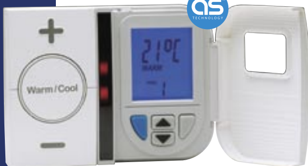
AS2-RF Control unit installed in normal thermostat location

For day-to-day use only 3 buttons are needed. The centre 'WARM/COOL' button changes the temperature state and the '+' and '-' buttons provide fine user adjustment as well as audible feedback. Each adjustment is immediately reflected in changes to the bright red and blue LED display.